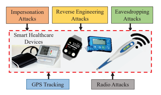
Fig. 1: Attacks on Consumer Electronic Systems.

Fig. 1 shows various threats on consumer electronic systems. IoMT devices such as an insulin pump can be configured remotely through remote control. An attacker can impersonate the remote control and send a malicious configuration to the device turning it into a potential threat to the consumer, where in some cases, it becomes lethal [4]. This paper presents a device authentication protocol for a network of IoMT devices which can increase the security of the system thereby making the network resistant to such attacks.